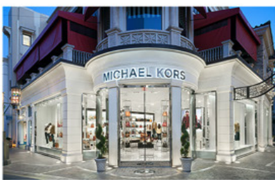
Los Angeles, California

Michael Kors is an American based company with a global reach. Michael has over 65 boutiques across the world in key fashion cities like Los Angeles, California; New York City, New York; Paris, France and Shanghai, China. Many celebrities are wearing the Michael Kors brand because Michael designs his products to stand out, but also blend with the current style. Some celebrities who wear Michael Kors are: First Lady Michelle Obama, Blake Lively and Bette Midler. The Michael Kors distribution spans across all distribution locations with over 65 boutiques, more than 235 shop in shop locations and more than 9500 additional selling locations.