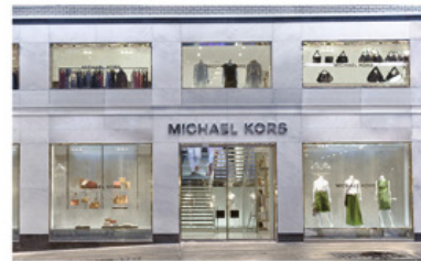
New York, New York